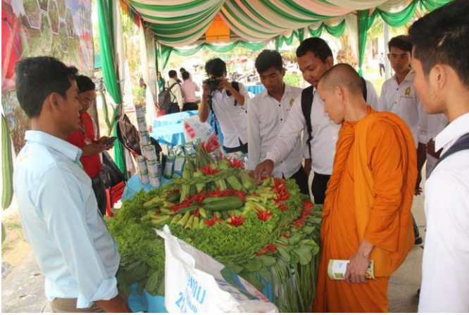
University of Battambang, Cambodia