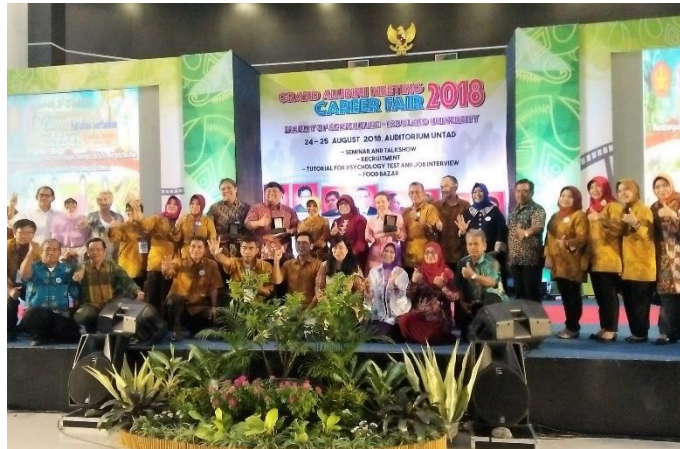
Tadulako University, Indonesia