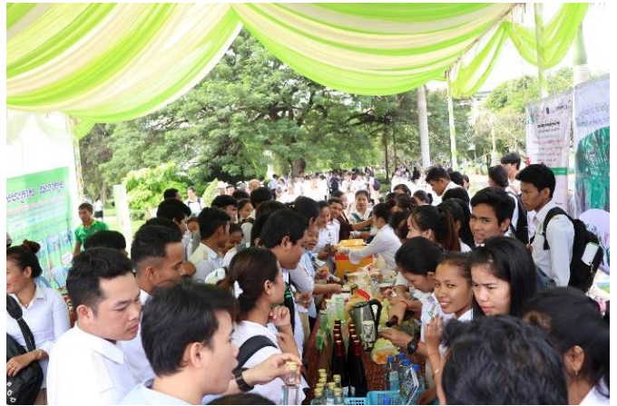
Royal University of Agriculture, Cambodia