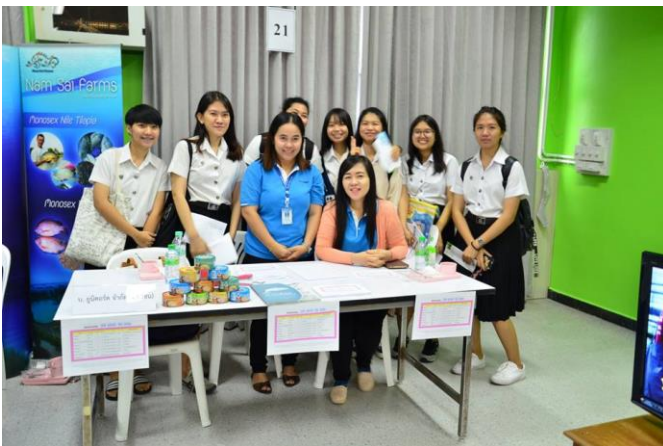
Kasetsart University, Thailand