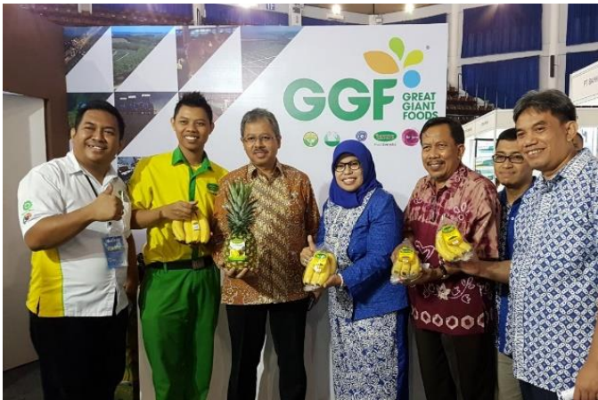
Bogor Agricultural University, Indonesia