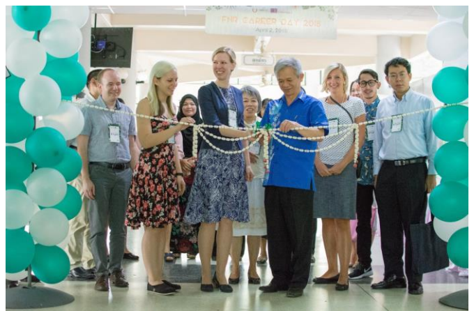
Prince of Songkla University, Thailand